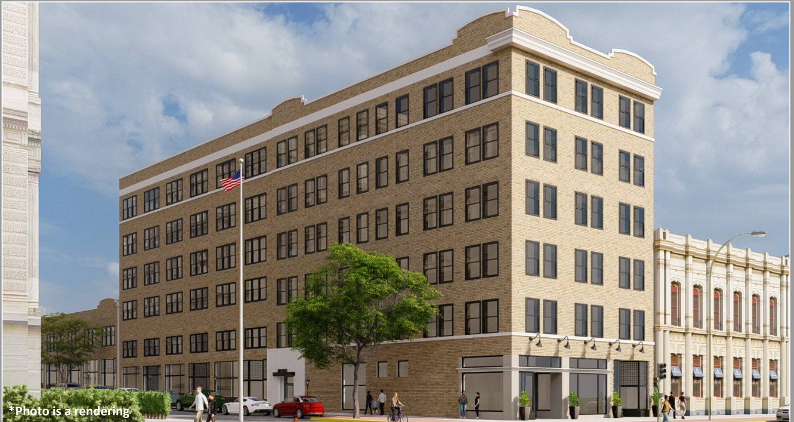
*Photo is a rendering

COMMERCIAL REAL ESTATE SALES | LEASING | CONSULTING | DEVELOPMENT | MANAGEMENT